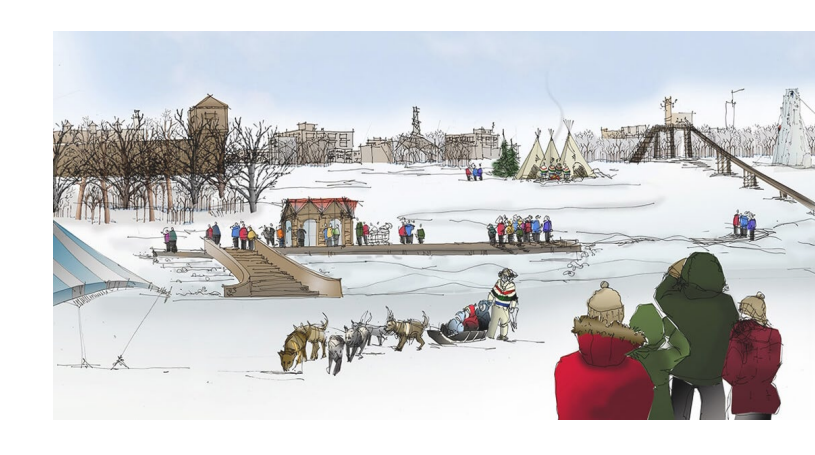
FIGURE 11 | Go to the Waterfront - Concept art

Go to the Waterfront was a visionary planning study completed by Scatliff + Miller + Murray in 2015. The study's purpose was to develop and share ideas for future development along Winnipeg's rivers. The study highlighted the importance of improving connectivity among different sites, supporting river-based activities in all seasons, developing transportation functionality, and improving environmental sustainability and ecological functionality<sup>12</sup>.