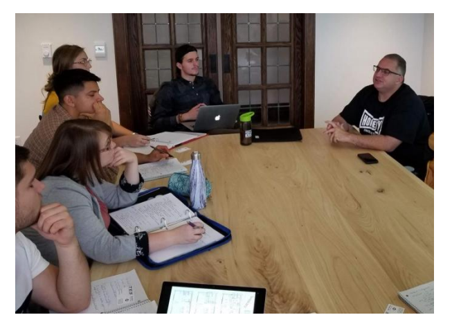
Figure 9: Suitehom Presentation, CMU Centre for Resilience

For a social enterprise model of affordable housing provision to work, collaboration is needed between stakeholders across public, private and non-profit sectors. About Face participants are dealing with complex issues, and the participation of government and non-profit social service providers is integral to their success. Since a lot must happen before the social enterprise aspect of the project kicks in, the involvement of professionals willing to provide their expertise bono, and construction pro companies willing to donate labour and materials, have made the Suitehom project viable.