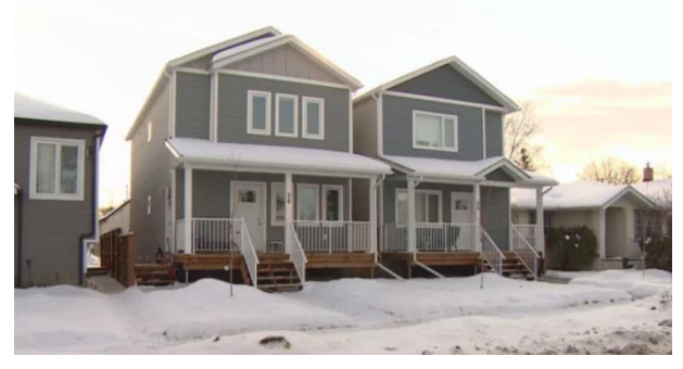
Figure 8: Infill Housing on Vivian Street in Winnipeg

Funding from the Province of Manitoba requires that homeowners who build secondary suites keep them affordable for at least ten years<sup>18</sup>. Suitehom is not designating where units will be located, so the initiative has the potential to create affordable housing which is integrated throughout a variety of neighbourhoods in Winnipeg, and across Manitoba.