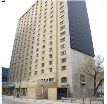
Figure 2: 185 Smith St, sold by Manitoba Housing in 2018

More and more Winnipeggers are being priced out of the housing market. Winnipeg experiences a slower pace of growth and less development pressure than cities with the hottest housing markets, like Toronto and Vancouver. Even so, the disparity is growing between the amount low-income Winnipeggers receive from low-wage employment and income supplements and the cost of private market rental units<sup>1</sup>. Historically, social housing has helped to fill this gap, by giving Winnipeggers access to subsidized housing provided by governments and non-profit organizations. Across Canada, social housing operating agreements between the Federal government and non-profit housing providers non-profit are expiring, and housing providers must raise rents to compensate for the losses in funding<sup>2</sup>. In Manitoba, the provincial government has also reduced investment in social housing and sold off some of their portfolio in recent years<sup>3</sup>. Together, these trends have made it more difficult for the poorest Winnipeggers to adequate. safe and affordable access housing.