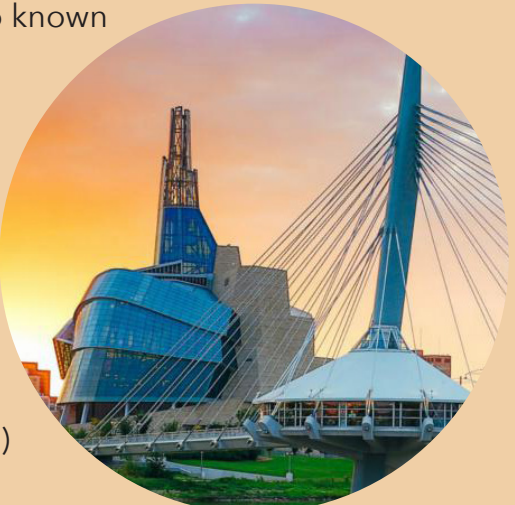
Figure 1: Winnipeg

Our urban planning systems have contributed to city dwellers' unequal right to the city. For example through NIMBYism in community engagement, communities can resist affordable housing and transportation options, contributing to poverty (Elliott, 2008). This case in point highlights the work that United Way Winnipeg is doing to address poverty in Winnipeg, through a poverty simulation called Living on the Edge. It proposes that the poverty simulation model could provide an example of how urban planners can tackle NIMBYism through empathy building community engagement, and create cities that work better for everyone.