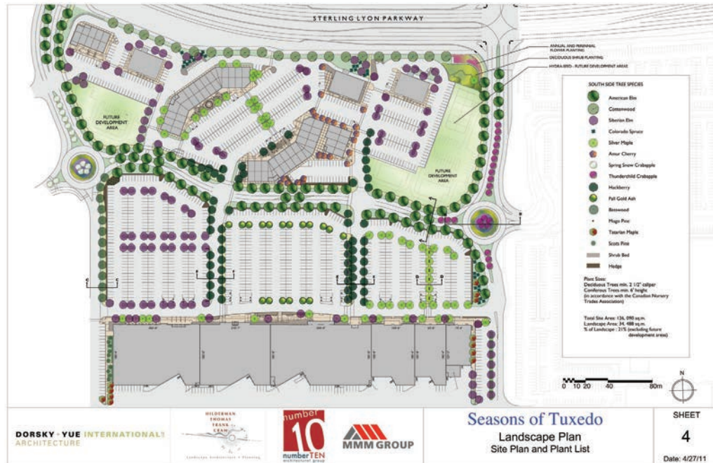
Above: Site plan and proposed areas for future development. Received from MMM Group Ltd.