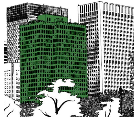
Above: A green lease is a real-estate development opportunity for commercial tenants and landlords.