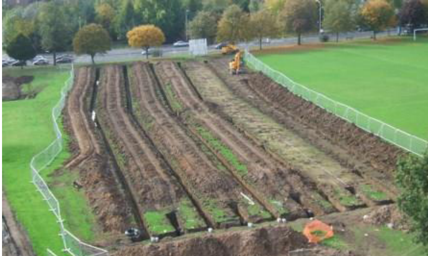
Above: Example of trenches for a closed ground loop system.