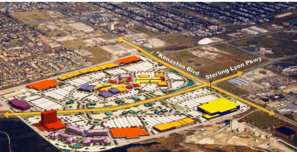
Above: Aerial view of Seasons of Tuxedo.

In simplest terms, geothermal energy refers to the heat that comes from the earth, or the thermal energy of earth's interior. Compared to natural gas and heating, geothermal energy significantly reduces greenhouse gas emissions, is a clean source of reliable electricity, offers lower operating costs, and is more energy efficient (CanGEA, 2015). To retrieve geothermal energy an underground piping system, known as a ground-coupled heat exchanger, is used. These pipes are in constant contact with the earth and are either closed or open loop. The geothermal system at Seasons is known as a closed ground loop system. Closed loops are sealed pipes buried underneath the ground that carry energy in or out of the heat pump system inside a building. These pipes use environmentally friendly solutions, are very reliable, and require low maintenance. In winter, heat pumps take heat from the ground to heat buildings, and in summer the heat pumps reverse to push heat back into the ground. Heating or cooling is then spread through a forced-air distribution system, similar to a conventional furnace (Geo-Xergy Inc., 2015).