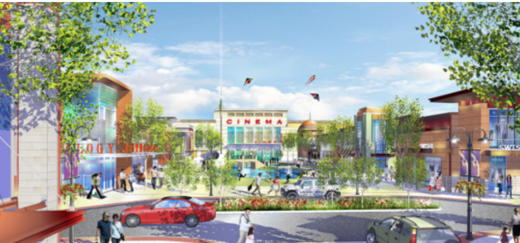
Above: Seasons of Tuxedo is a multi-building, multi-tenant retail development in south west Winnipeg.

MCP Candidate | University of Manitoba MCP, Planner | MMM Group MCP, Senior Project Manager | MMM Group