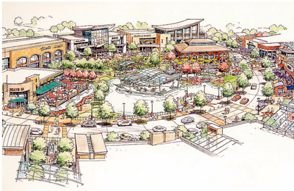
Above: Renders for the North Side.

developers retained ownership of the ground loop to operate them as a utility to provide heating and cooling to tenants in each building. The return on investment for this geothermal system was estimated to be less than eight years, with each of the tenants eventually and significantly benefitting from significantly lower utility costs (Government of Manitoba, 2012).