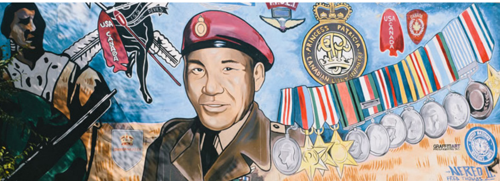
Above: Street Mural in the North End of Winnipeg

"The Mayors Engaged Task Force". (2012). City of Vancouver: http://vancouver.ca/files/cov/final-report-engaged-city-task-force-2014.pdf .