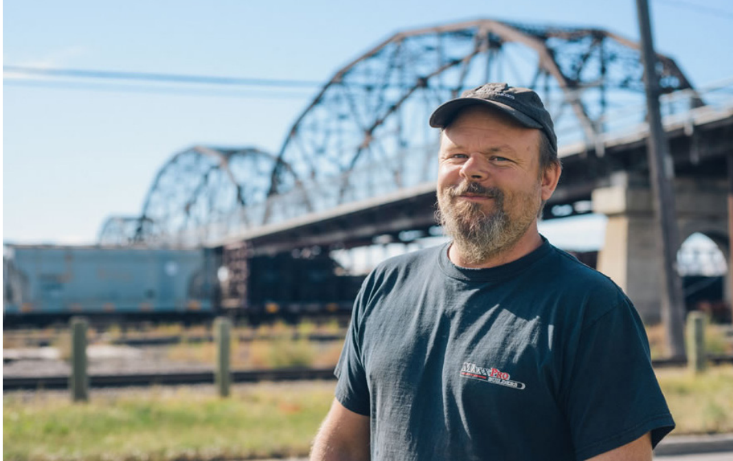
Above: Community member in front of the Arlington Bridge and

The success of the second workshop was due to intensive and well-thought out processes that led to its collaborative form. It is hoped that the duration of the project will continue to deliver the interactive engagement that