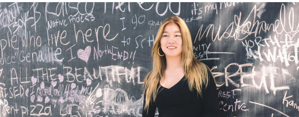
Above: Public Art in Winnipeg's North End and received from the City of Winnipeg, 2014