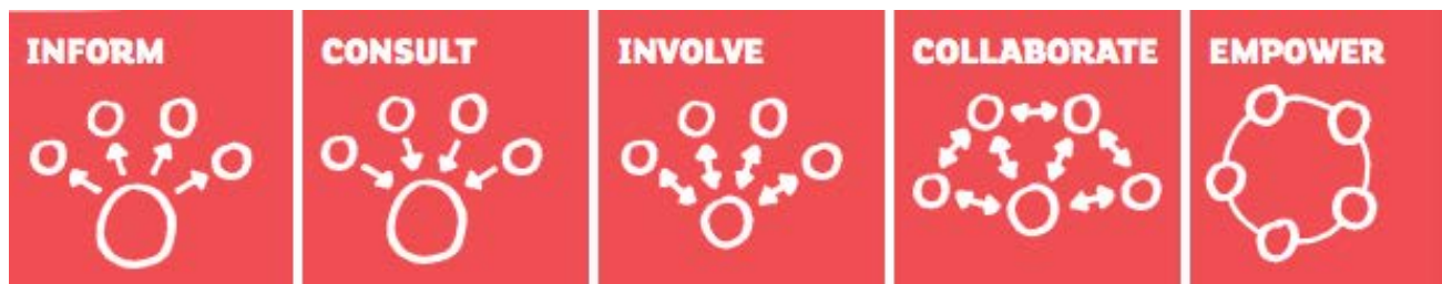
Above: Complete Engagement Spectrum Graphic and received from The City of Vancouver

A collaborative planning process is argued to be a complete approach. The City of Vancouver’s spectrum of public participation (seen in the figure below) provides an in-depth and complex continuum of various levels needed for a successful community engagement project and process. The workshop, as well as the process at large, follows the participative spectrum to create an empowered community engagement session. It first informed the community to provide an