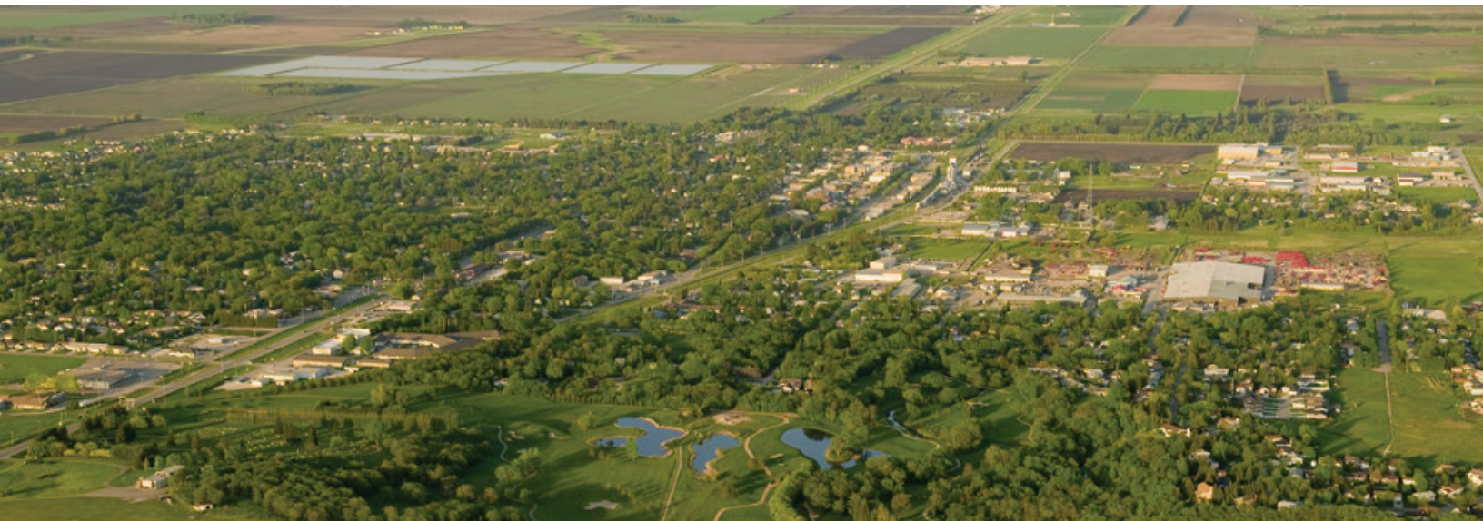
TOP IMAGE Elevator in Winkler, Manitoba. • MIDDLE IMAGE Miami Northern Pacific and Manitoba Railway Station. • BOTTOM IMAGE Aerial Shot of Mordon, Manitoba.