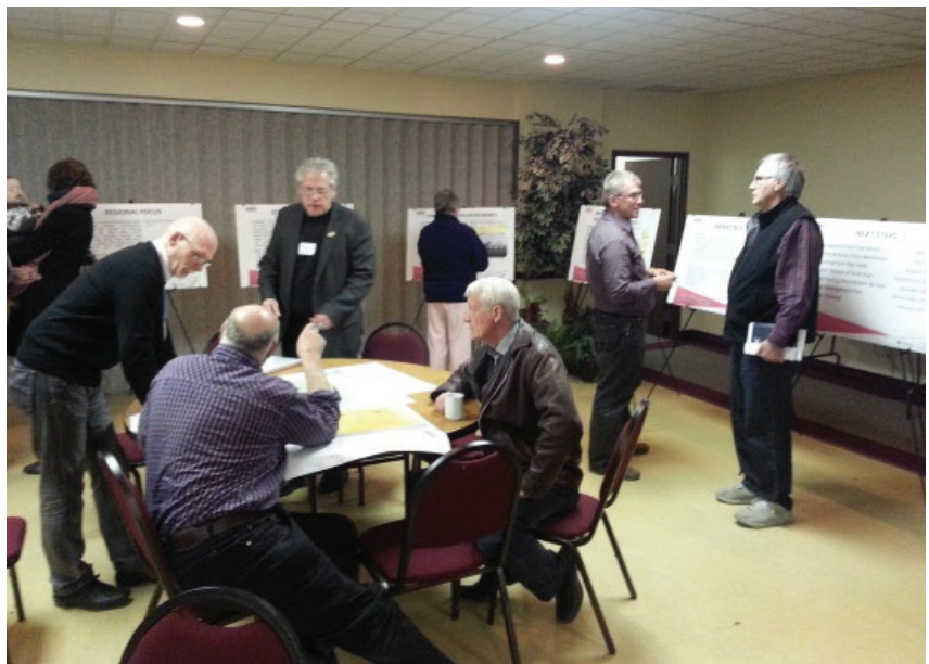
BELOW May 2013, Municipal officials, councillors, and stakeholders from across the region attend an open house.

The policies listed in the MSTW Development Plan are intended to provide decision-makers with direction rather than be followed as a detailed action plan. Phrases such as, "where applicable" and "where relevant," are used in some policies to support the appropriate and flexible application of the Plan by the Planning District and Council. Its structure also reflects how people live, work, and play in the region by creating policies in five distinct categories: Urban Areas, Emerging Communities, Stanley Corridor, Village Areas, and Rural Areas. These area designations were created based on how lands in the MSTW Region are used. Guiding Priorities identified through consultations with the