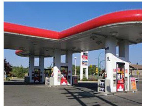
Image 3: Muskeg Lake Cree Nation Urban Reserve, Saskatoon, Saskatchewan.

Creating an urban reserve is a complex process, which takes much dedication, organization, and communication.