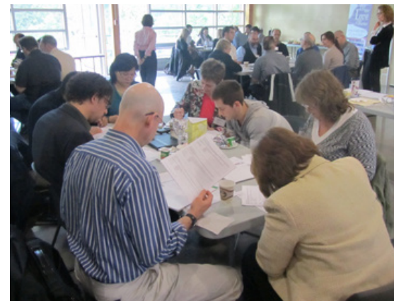
Implementation was always part of the plan: WinterCity Implementation Workshop (City of Edmonton, 2013)

A key part of the planning process is to approach stakeholders who are experts in the subject at hand. A multi-disciplinary team that is invested in the success of a plan will help carry out recommendations and can also anticipate barriers to implementation.