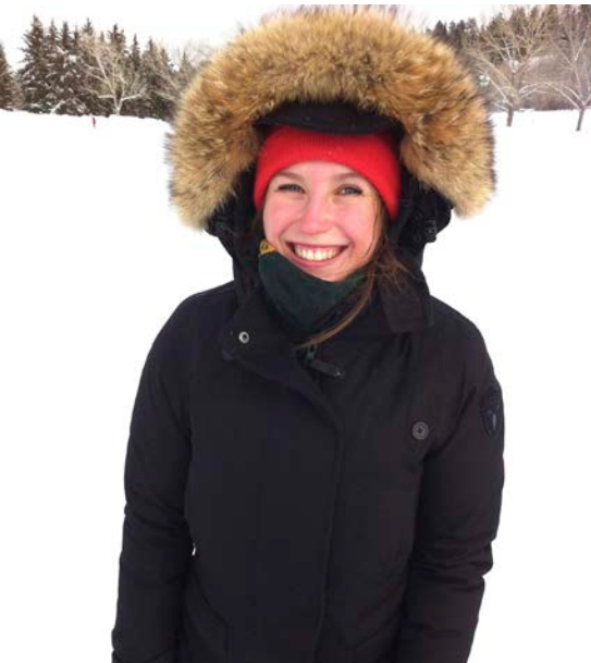
Skating in Hawrelak Park is a popular wintertime activity for Edmontonians and their guests (Donoff, 2014)

Targeting multi-disciplinary stakeholder participation from the onset, Edmonton's Winter City Advisory Council created a plan nearly guaranteeing successful implementation.