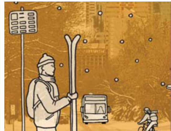
For the Love of Winter envisions new ways Edmontonians can enjoy the city, even in the coldest months (City of Edmonton, 2012)

Edmonton's WinterCity Strategy, For the Love of Winter: Strategy for Transforming Edmonton into a World-leading WinterCity (City of Edmonton, 2012) is innovative, creative, and organized for successful implementation because it is rooted in the ideas of its citizens.