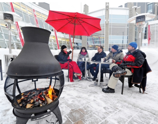
Edmontonians would like to see more winter patios like this one at Cafe Bicyclette

Public consultation is done regularly, although the planning and implementation process are not greatly impacted by this type of citizen participation. A more effective exchange is through partnership or delegated power, where the inclusion of citizens throughout the process creates a sense of ownership and purpose, leading to a stronger strategy, plan approval rate, and ultimately greater success in implementation.