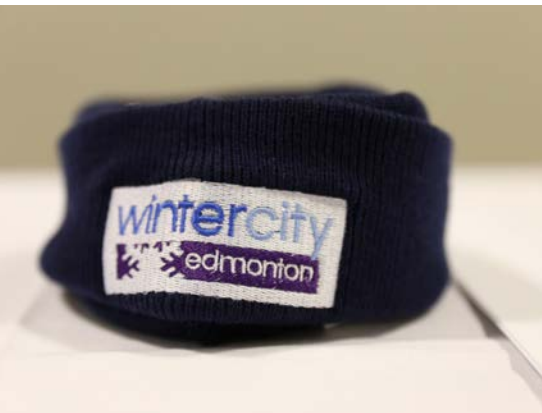
This WinterCity hat is just one of the many ways the WinterCity Strategy is being promoted (Mack Male, 2013)

With a goal to spawn a “blizzard of ideas” (City of Edmonton, 2012), Edmontonians were asked, “What would make you fall in love with Edmonton?” Many of the ideas generated (through tools such as the online IdeaScale, which allows citizens to enter their winter city ideas and rate the ideas of others) are reflected in the strategy, and were independent of ideas generated by other methods.