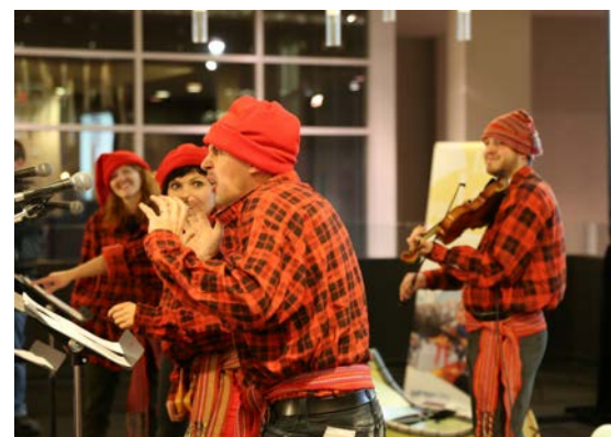
The Flying Canoe Adventure performs at WinterCity Edmonton's Premier to Winter Event (Mack Male, 2013)

The WinterCity Strategy was heavily publicized and launched at a kick off event followed by a half-day symposium. Presentations to stakeholder groups and nearly twenty in-depth dialogue sessions and workshops targeted key groups for their input. Beyond targeted stakeholder participation, the WinterCity Advisory Council reached out to the public via televised contests, postcard campaigns, social media, and an online crowd-sourcing tool to gather over 1000 ideas for improving Edmonton as a winter city.