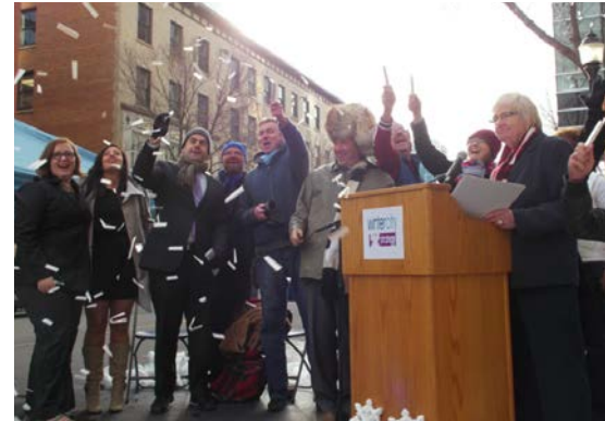
The WinterCity Strategy was launched at an outdoor event well-attended by stakeholders (www.benhenderson.net, 2013)

Including these targeted stakeholders from the strategy's inception warrants participant buy-in and helps to anticipate potential implementation problems while the strategy is being created.