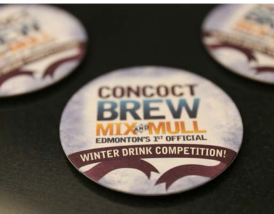
WinterCity Edmonton launched a winter drink competition to build awareness around the city's winter potential (Mack Male, 2013)