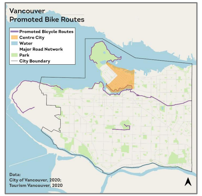
Figure 2. Promoted bike routes in Vancouver

I conducted a spatial analysis on routes promoted to tourists from the following three online articles on the respective city tourism organizations - Five Great Bike Rides (Tourism Vancouver), 10 Epic Bike Pathways in Calgary (Tourism Calgary), and Top Cycling Routes in Toronto (Tourism Toronto). This research method found that almost every route promoted had a natural scenery component, like the tourism brochures' areas. Additionally, most routes were linear instead of circuitous, composed of multi-use paths, and located away from the city's centre. The map showing these routes for Vancouver is shown below.