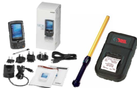
Trace IT software bundle

A farmer, using the software bundle solution, can scan the animal's tag & transmit the information to the ATQ Server.