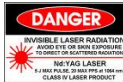
Class 4 laser label