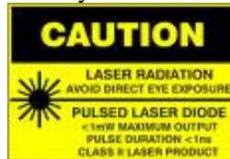
Class 2 laser label

All lasers are labeled to identify the hazard.