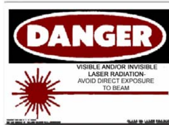
Class 3B label

All lasers are labeled to identify the hazard.