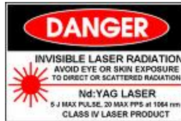
Class 4 label