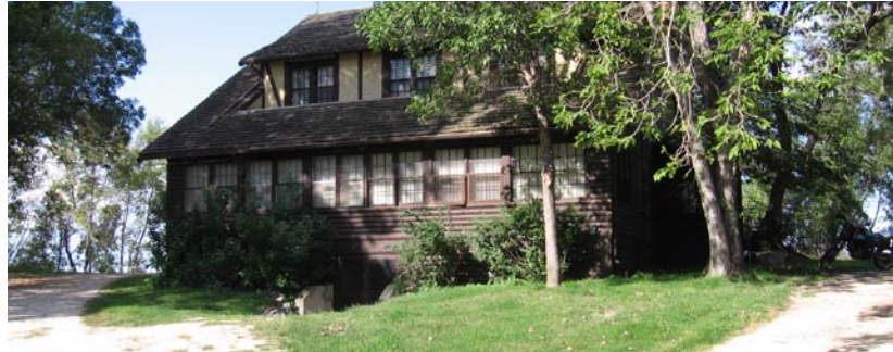
Mallard Lodge at Delta Marsh Field Station.