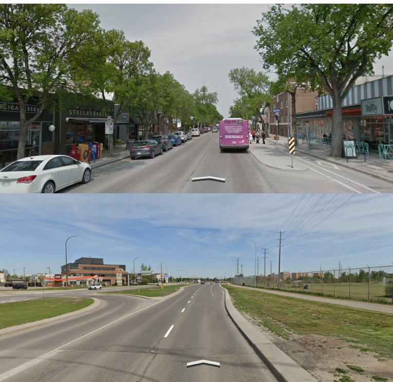
Figure 1: Sherbrook St. (above) has features such as trees, street furnishing, a protected bike lane, and zero-foot setbacks promoting lower speeds. Figure 2: Waverly St. (below) has deep setbacks and a wide field of view for motorists that promotes higher vehicle speeds.

The Enhanced Summer Bike Route (ESBR) program was first established by the City of Winnipeg in the spring of 2020 as a pandemic response measure at the time called Open