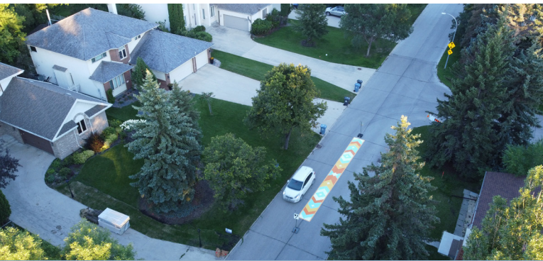
Figure 6: Houses are set back further from the street on Kilkenny Drive. Artist: Taylor McArthur Credit: Stéphane Dorge @CoolStreetsWPG

The results of the Paint the Pavement pilot project demonstrate changing the posted speed limit alone does not always encourage a change in travel speed. The study streets are wider collector roads that are not designed to self-enforce lower speeds (Patman, 2023). The widths of Churchill Drive, Kilkenny Drive, Lyndale Drive, and Wellington Crescent ranged 7.5-12m. The streets also have wide clear zones and deep setbacks between the houses and the road. Thoughtful and physical road design changes may be required to self-enforce lower speed limits. The painted murals are examples of low-cost interventions compared to building a physical concrete curb or median. Effective design changes need to be considered with the municipal budget and capacity due to high construction costs. New and rebuilt roads that do not create speed problems can be solved by implementing new street design standards. One approach for municipalities is to use a phased approach that prioritizes high-risk roads first when working with limited or deficit budgets.