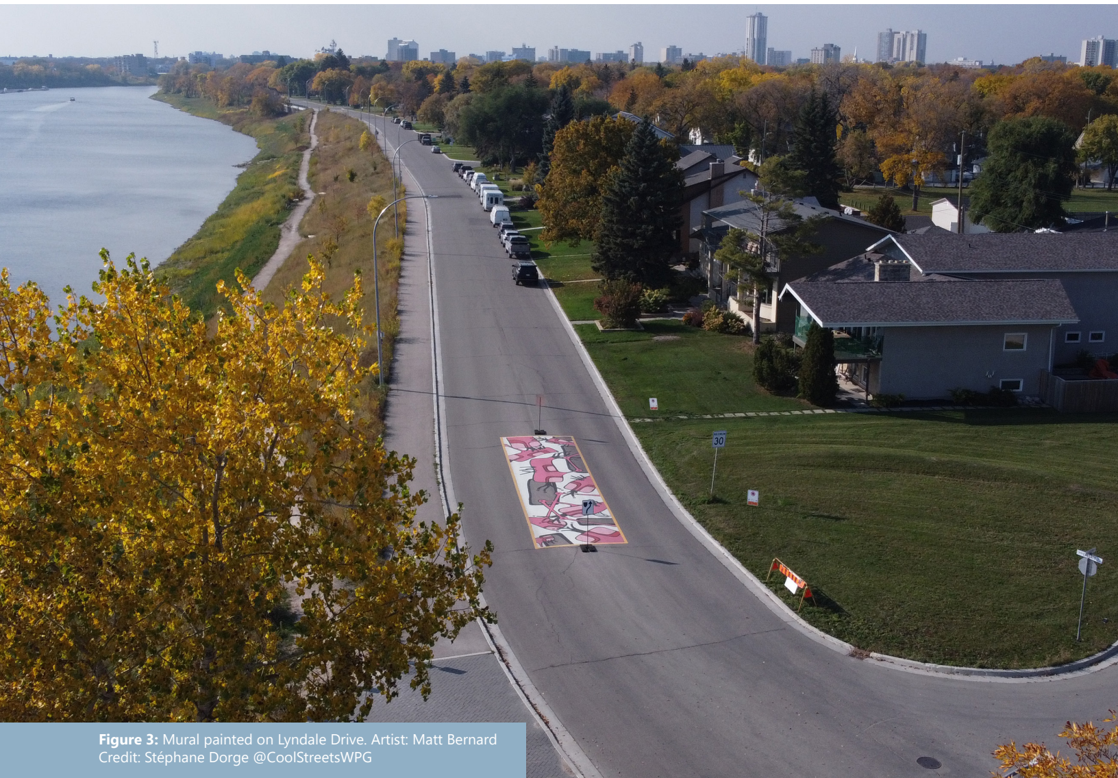
Figure 3: Mural painted on Lyndale Drive. Artist: Matt Bernard

The interventions Public Works installed were based on feedback, traffic/cycling data and counts. In May of 2022, data revealed that motor vehicles were still moving too fast at some locations on the ESBR streets, including Churchill Drive, Kilkenny Drive, Lyndale Drive, and Wellington Crescent. The City decided to implement additional traffic calming interventions on these higher-speed streets.