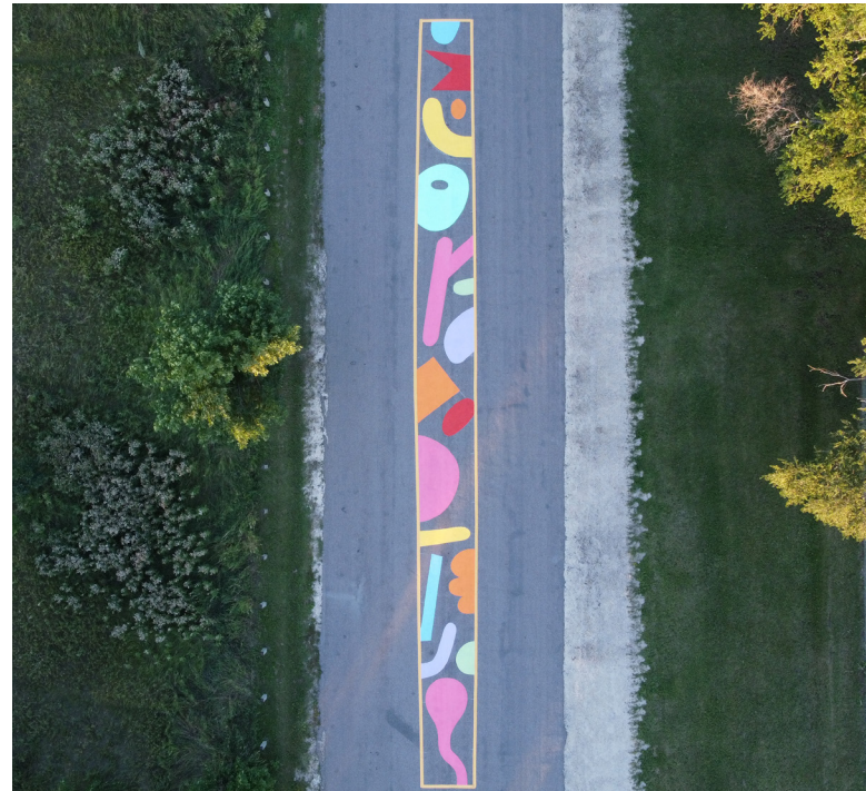
Figure 5: A mural on Churchill Drive. Artist: Takashi Iwasaki.

One significant factor when testing pilot projects is to measure the results. Paint the Pavement was measured by answering three questions: Did motor vehicles slow down? Did the paint do its job? What does the community think?