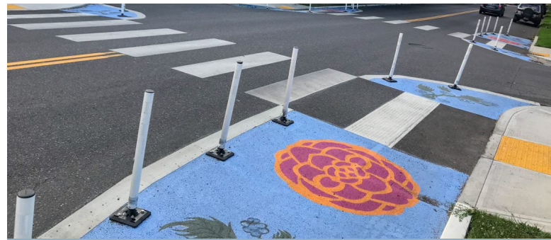
Figure 7: Plastic delineator wands are being used in addition to painted extended curbs in Portland, Oregon.

the road while using the streets. Pedestrians had these same comments. The absence of sidewalks on Churchill Drive, Lyndale Drive, and Kilkenny Drive forced pedestrians to walk off the road or into the middle of the road when vehicles passed. Therefore, road design should include a range of intended users such as vehicles, pedestrians, and cyclists.