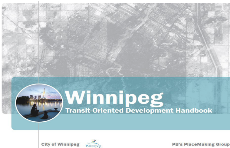
FIGURE 6 | Winnipeg's TOD Handbook.

Winnipeg developed a TOD handbook that illustrates different TOD typologies and different scales of densities and land use mix that support the use of the transit system. And, as mentioned, major City of Winnipeg planning and transit policy documents are currently being re-drafted, fully integrating land use and transit.