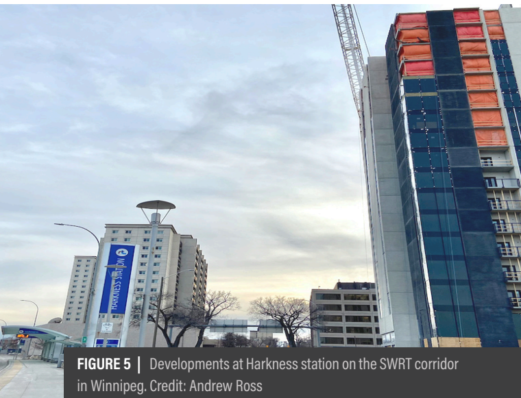
FIGURE 5 | Developments at Harkness station on the SWRT corridor in Winnipeg.

Winnipeg developed a TOD handbook that illustrates different TOD typologies and different scales of densities and land use mix that support the use of the transit system. And, as mentioned, major City of Winnipeg planning and transit policy documents are currently being re-drafted, fully integrating land use and transit.