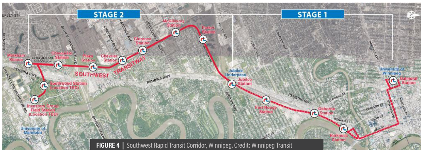
FIGURE 4 | Southwest Rapid Transit Corridor, Winnipeg.

The implementation of phase one of the Southwest Rapid Transit Corridor has resulted in several new developments. A 1,000-unit development in the Fort Rouge Yards, mixed-use towers currently being built close to the Harkness and Osborne rapid transit stations, and developments in Bishop Grandin Crossing, are examples of projects built through a coordinated land use and transportation planning (Winnipeg Transit, 2014). Winnipeg's zoning by-law reduces the parking minimum for properties zoned "TOD" by 50% of the normal prescribed amount.