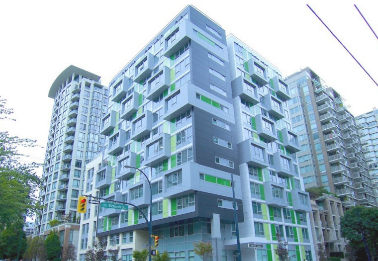
FIGURE 3 | A 162-unit affordable housing tower within 450 metres of a transit station in downtown Vancouver.

In low-density sub-urban development areas, there is a focus on road infrastructure and car culture is rife. In some newer neighbourhoods, transit services are lower than they are in older ones (MacLean, 2017). There is generally lower ridership and limited expansion of transit service to newer neighbourhoods, in large part because of the low-density suburban development pattern. In the medium to high-density neighbourhoods such as Osborne Village, Corydon, the West End and parts of Old St. Boniface, transit and rapid transit are well integrated into the