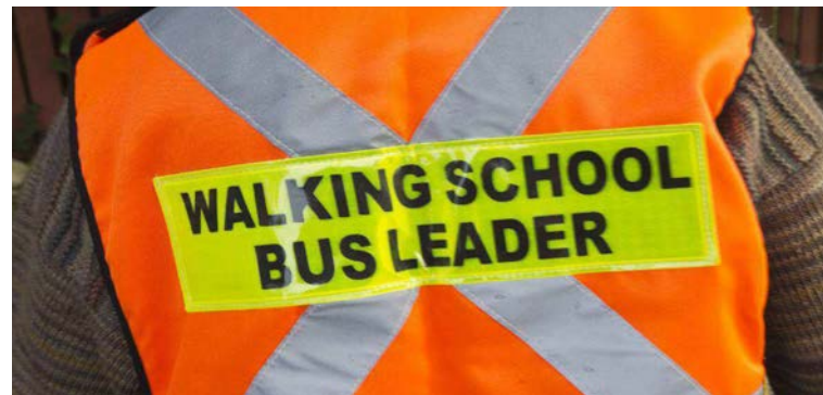
FIGURE 5 | Walking School Bus Leaders wear bright, reflective clothing to easily be seen. 5

Walking School Bus leaders were recruited, screened, insured, trained, managed and paid by the Ottawa Safety Council. There was 19 leaders hired who had to attend training on Occupational Health and Safety