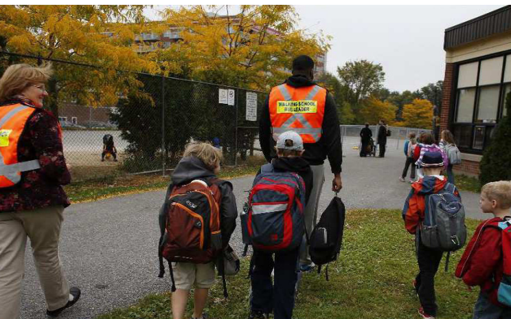
FIGURE 2 | A Walking School Bus arrives in time for the start of school. 5

be more comfortable allowing their children to walk to school when they know they will be safe and supervised. Safety is just one benefit of a Walking School Bus for children. The program also allows children to participate in physical activity, foster healthy habits, learn more about their neighbourhood, socialize with friends and meet children of other ages, gain independence and arrive at school on time. 4 Parents are able to meet other families through the program, have a greater peace of mind that their child will be safe on their route to school, and they save gas and time from not needing to drive to and from the school. 4 The leaders that walk with the children enjoy physical activity, are able to meet families and get to know the children as