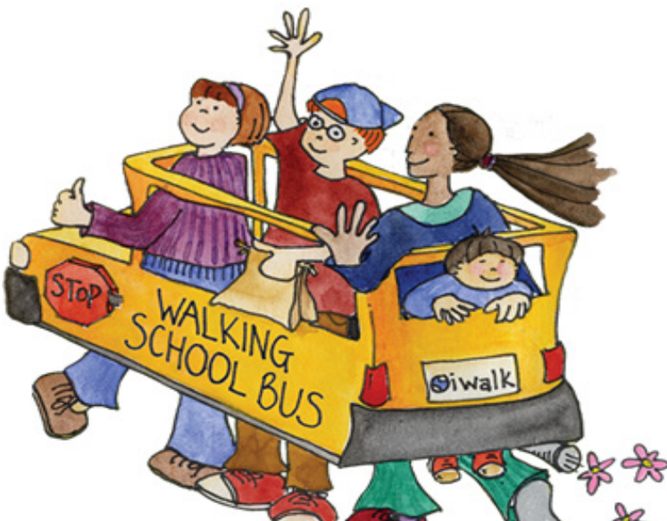
FIGURE 7 | Walking School Bus is a program of the Safe Routes to School movement.

Green Action Centre operates the Active and Safe Routes to School (ASRTS) program which has been in Manitoba for over a decade, working to increase children's mobility. ASRTS is a leader in School Travel Planning in Manitoba and offers help and resources to school communities that want to school travel plan. 12 The ASRTS has a Handbook & Resource Guide that features a section on Walking School Buses. In the guide there is an overview of what a Walking School Bus is, how to organize one, rules for children to follow when on the bus, a sample letter to promote the program, a registration form, and an example of how a school in Winnipeg runs the program. 13 This is a great resource that a school or parent can use when beginning a Walking School Bus because it will answer some of their questions and assist in planning the program.