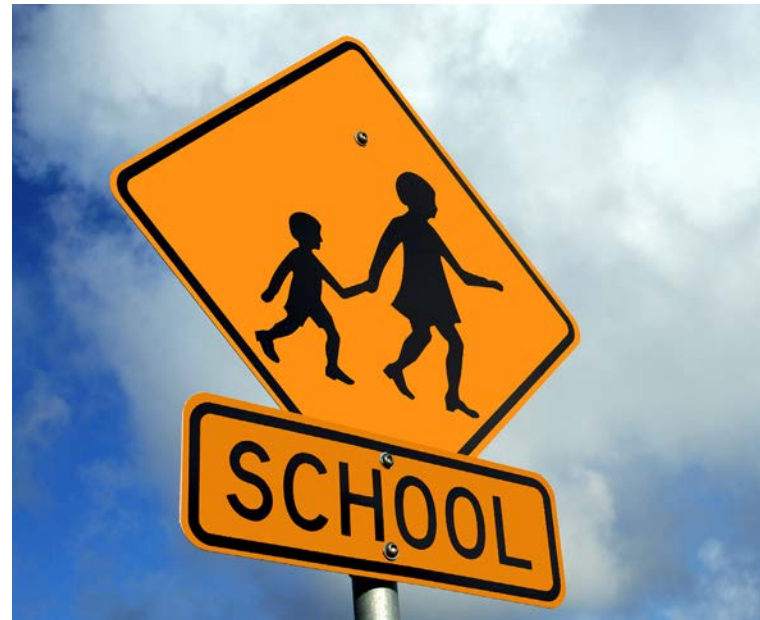
FIGURE 3 | Walking School Buses utilize cross walks and sidewalks to safely arrive at school. 6

well as the benefit of providing a service to the school. 4 Other benefits include lower greenhouse emissions, less traffic congestion around schools, and the program could contribute to active transportation advocacy in communities.