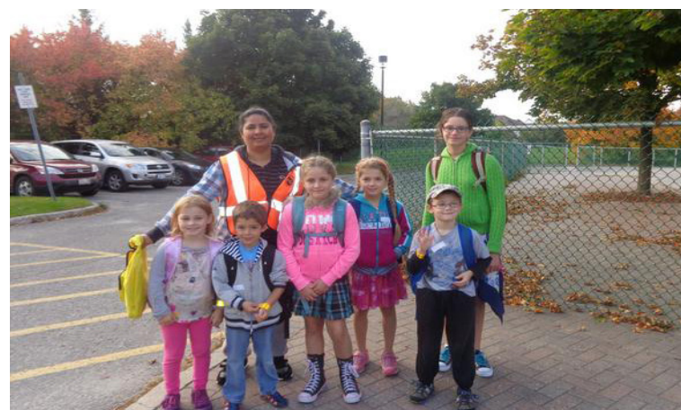
FIGURE 6 | First day of the Walking School Bus at Robert Bateman Public School.

Before the end of the pilot, two of the eight routes were permanently cancelled due to low registration, however