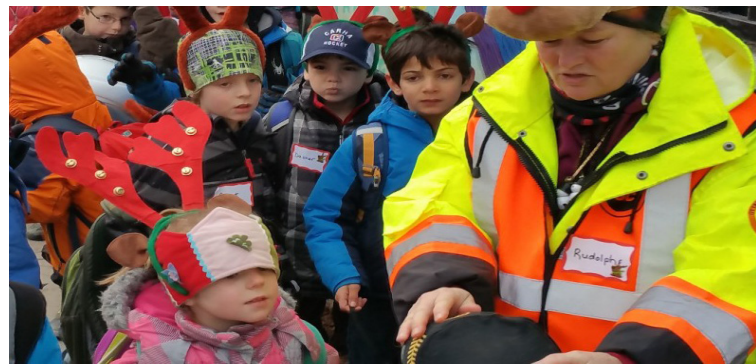
FIGURE 4 | Connaught Walking School Bus transformed into Santa's sleigh for the walk to school in December 2016. 10