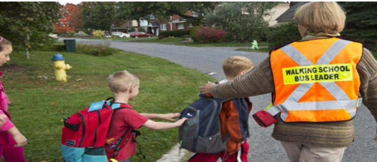
FIGURE 1 | A Walking School Bus leader walks children to school. 5

Walking School Buses have many benefits not only for children, but also for parents, volunteers, schools and the rest of the community. 4 Safety is a primary concern for parents and a reason why they are reluctant to allow their children to walk to school. 1 Providing the opportunity for children to walk to school with adult supervision may reduce these worries for parents. 1 Parents may