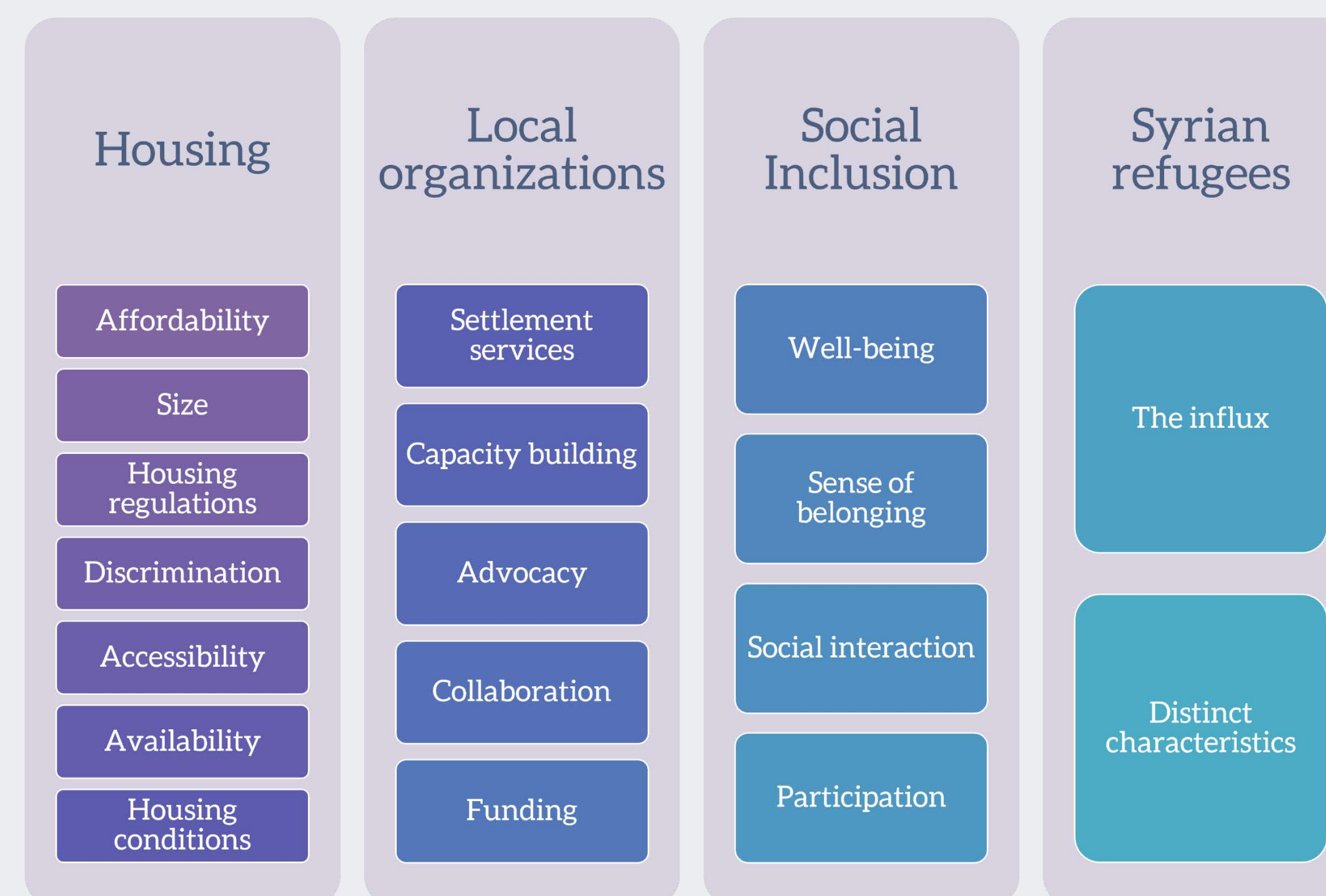
Table 1: Four primary themes and subcategories that emerged from an axial coding of the semi-structured interviews.

Local organizations assert that continuity in funding and opportunities to collaborate with other resettlement service providers would increase the quality of resettlement services provided. Local organizations realize the need to build their capacity to be more flexible and advocate for refugees, and to develop approaches or initiatives to facilitate the social inclusion of Syrian refugees.