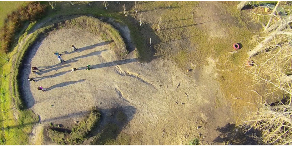
Left: Play Plate - this project achieves beauty and learning through the life and health of a 'non-domesticated' environment.

ground and having some mud underneath one's fingernails serves as an unforgettable treasure trove of experience. The students were paving field stones, constructing sod walls, painting car tires, sculpting earth, and teaching children. The only complaint heard was that the students would have to move back into the studio because of the forthcoming winter.