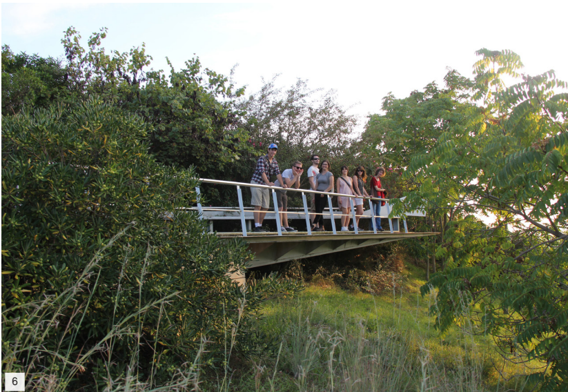
3 / Barcelona Pavilion - Don't miss Mies once you are in Barcelona! 4 / Jardí Botànic de Barcelona - The best gardens are those you never want to leave again 5 / Coastal City - But there is more than Mies! 6 / Landscape Balcony - Enjoying the beautiful scenery and the stunning view