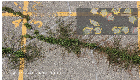
CRACKS, GAPS AND FUGUES