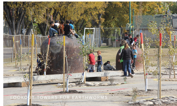
LOOKOUT TOWERS FOR EARTHWORMS

“... After many years of working together we have seen a drastic decrease in vandalism of our shared green space and now with the creation of the Folly Forest the children of this neighborhood see themselves as stewards of the environment.”