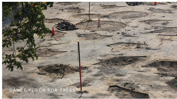
DANCE FLOOR FOR TREES